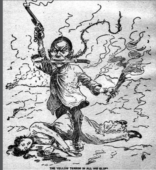
"The Yellow Terror In All His Glory," 1899 editorial cartoon.

The term "The Yellow Peril" has long since passed out of fashion, but it was a widely used expression in the late nineteenth and early twentieth centuries. The nightmare of wild oriental hordes swarming from the East and engulfing the "civilized" societies of the West was a popular theme in literature and journalism of the time. Yellow Peril supposedly derives from a remark made by German Kaiser Wilhelm II following Japan's defeat of