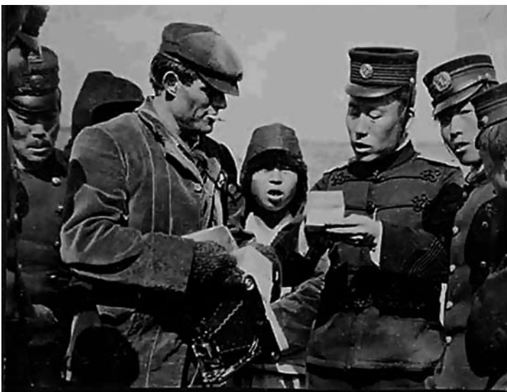
Jack London has his travel papers checked by a Japanese soldier while on assignment in Korea.