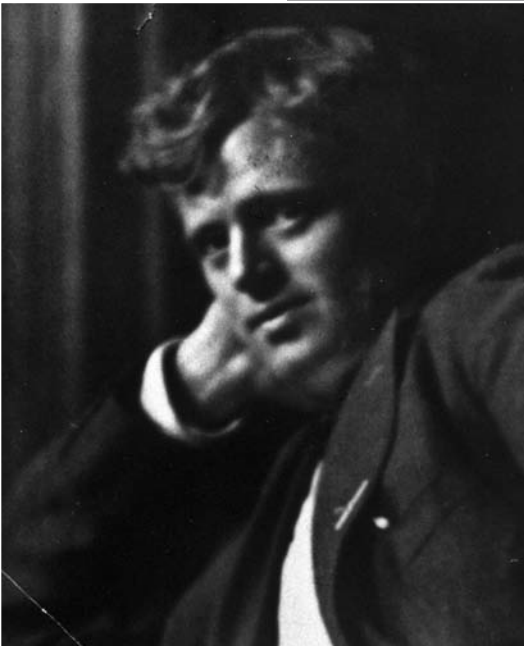
Portrait of Jack London by Arnold Genthe. Image source: The Berkeley Digital Library Sunsite as http://london.sonoma.edu/cgi-bin/londonimages.pl?keyword=Jack+London .

China in 1895 in the first Sino-Japanese War. The expression initially referred to Japan's sudden rise as a military and industrial power in the late nineteenth century. Soon, however, it took on a more general meaning embracing the whole of Asia. Writing about the Yellow Peril encompassed a number of topics, including possible military invasions from Asia, perceived competition with the white labor force from Asian workers, the supposed moral degeneracy of Asian people, and fears of the potential genetic mixing of Anglo-Saxons with Asians. 1