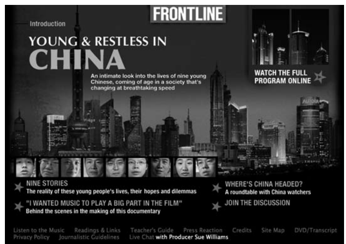
Screen capture of the opening page of Young and Restless in China . http://www.pbs.org/wgbh/pages/frontline/youngchina/ .

There are several sources that plug into the lives and lifestyles of Chinese urban youth. I highly recommend the Frontline episode “Young and Restless in China,” available online. 17 The film profiles adults