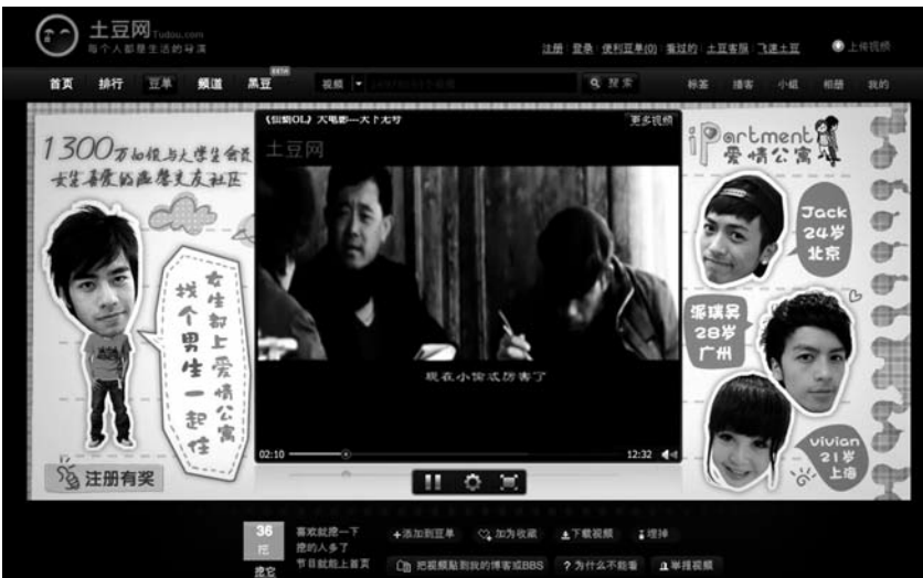
Screen capture of the Tudou Web site at http://www.tudou.com/programs/view/XpQChd-kbE8/ .

Young Chinese netizens are plugged into the world—writing about themselves in blogs and online novels, breaching firewalls to connect globally, and posting clips on Tudou .