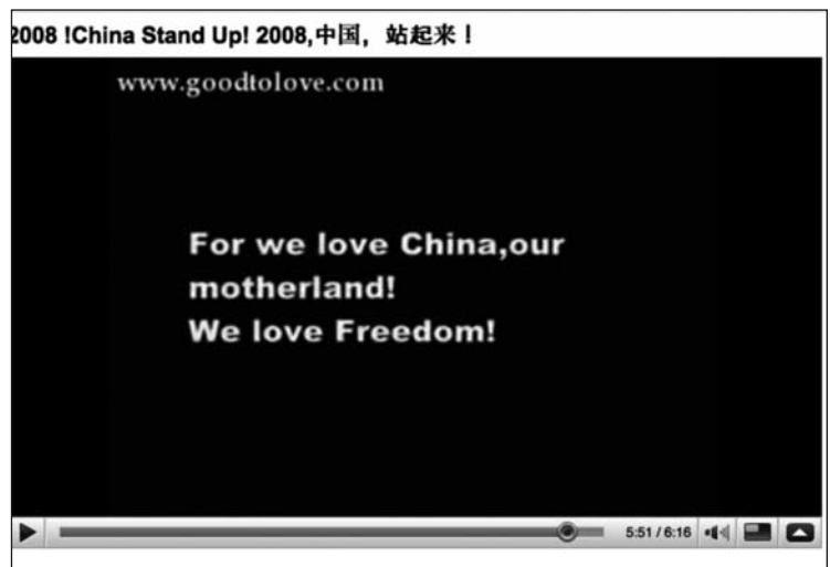
Screen capture of a segment of 2008 China Stand Up .

Among the loudest voices on political matters are “angry youth” ( fenqing ), referring to China’s young ultranationalists with fiercely anti-Western or anti-Japanese sentiments . . .