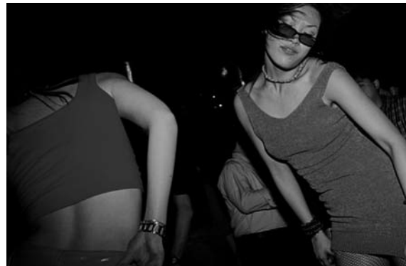
Shanghai nightclub scene.

The counterculture will intrigue students as it informs them of the limit-pushing behaviors possible in China today.