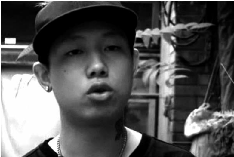
Screen capture of rapper Wang Xiaolei in Young and Restless in China . http://www.pbs.org/wgbh/pages/frontline/youngchina/ .