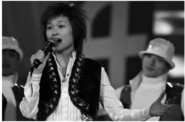
Super Girl Contest winner, Li Yuchun.

. . . rural youth watched as Li Yuchun won the Super Girl Contest, China's version of American Idol. They soak up images of new China and plan ways to escape a future in farming.